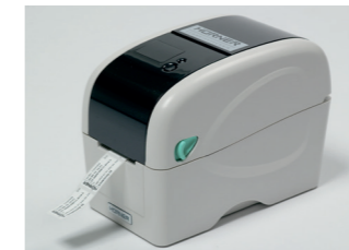
Tag printer and label tags

The HÜRNER movement pushbutton fitted to the basic machine chassis allows moving the machine carriage when the welder stands next to the chassis. This enables convenient welding without constant back-and-forth between the hydraulic and control box and the machine chassis.